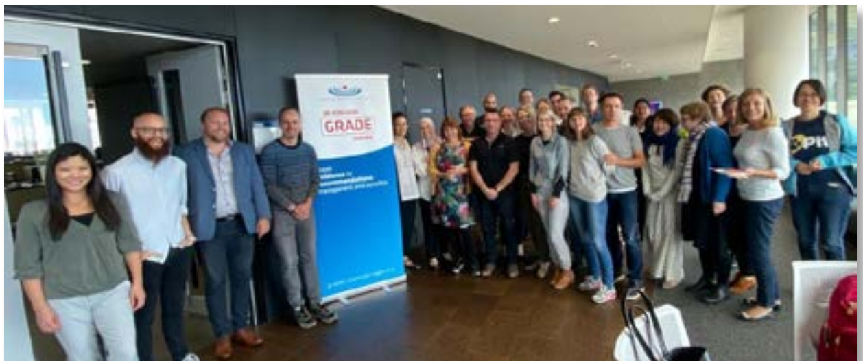
GRADE Working Group members at the GRADE Working Group Meeting in Adelaide.