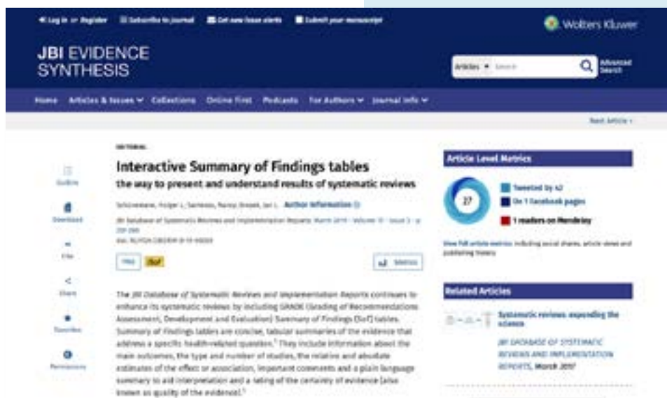
Figure: Editorial on iSoF tables