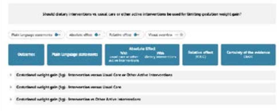
Figure 1: The new iSoF tables are linked from the standard SoF and contents of a JBISRRR systematic review